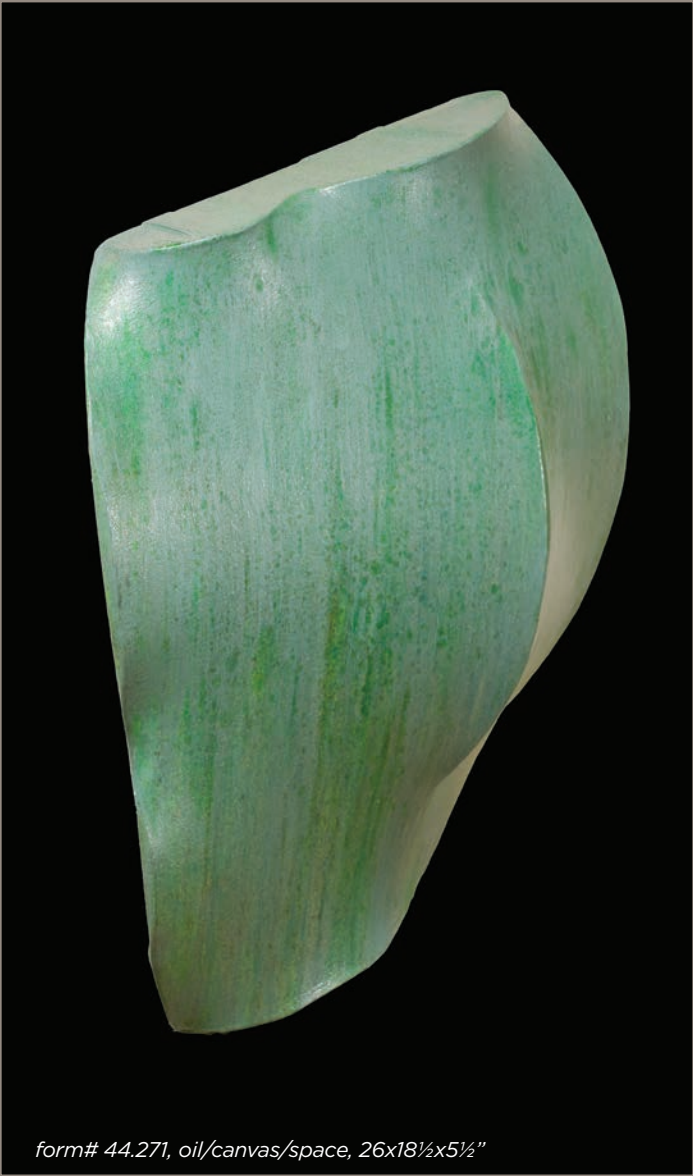
form# 44.271, oil/canvas/space, 26x18½x5½"