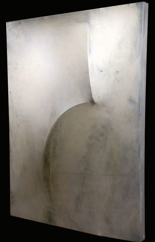
form# 33.012, oil/canvas/space, 65x44x12"