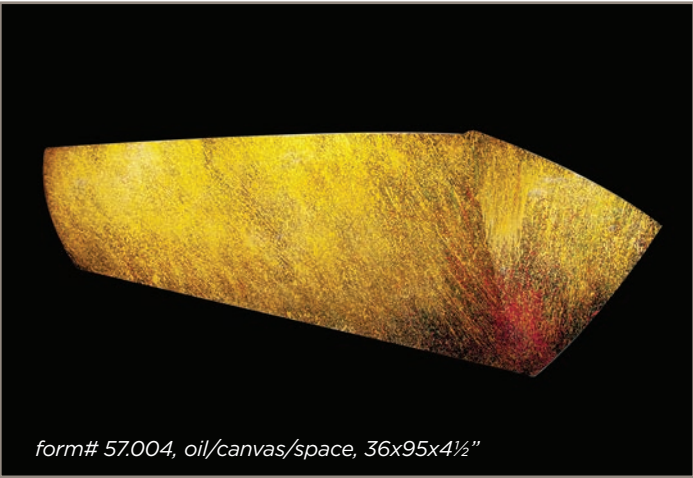
form# 57.004, oil/canvas/space, 36x95x4½"