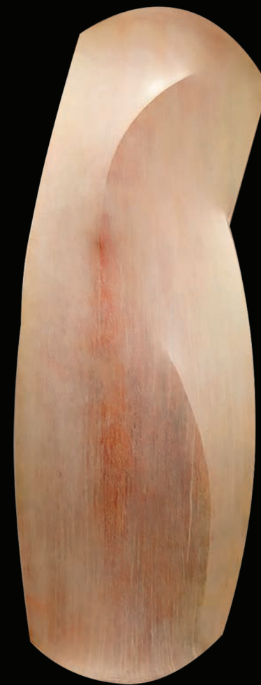
form# 44.001, oil/canvas/space, 122½x45½x15" installation, Carnegie Museum, Pittsburgh