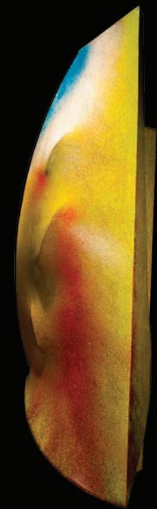
form# 52.001, oil/canvas/space, 69½x23x15" private collection