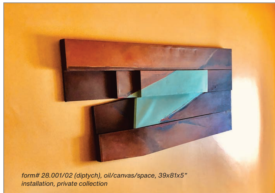
form# 28.001/02 (diptych), oil/canvas/space, 39x81x5" installation, private collection