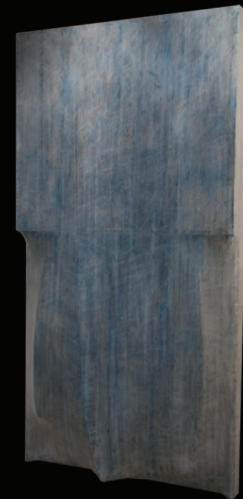
form# 34.007, oil/canvas/space, 81x42x8½"