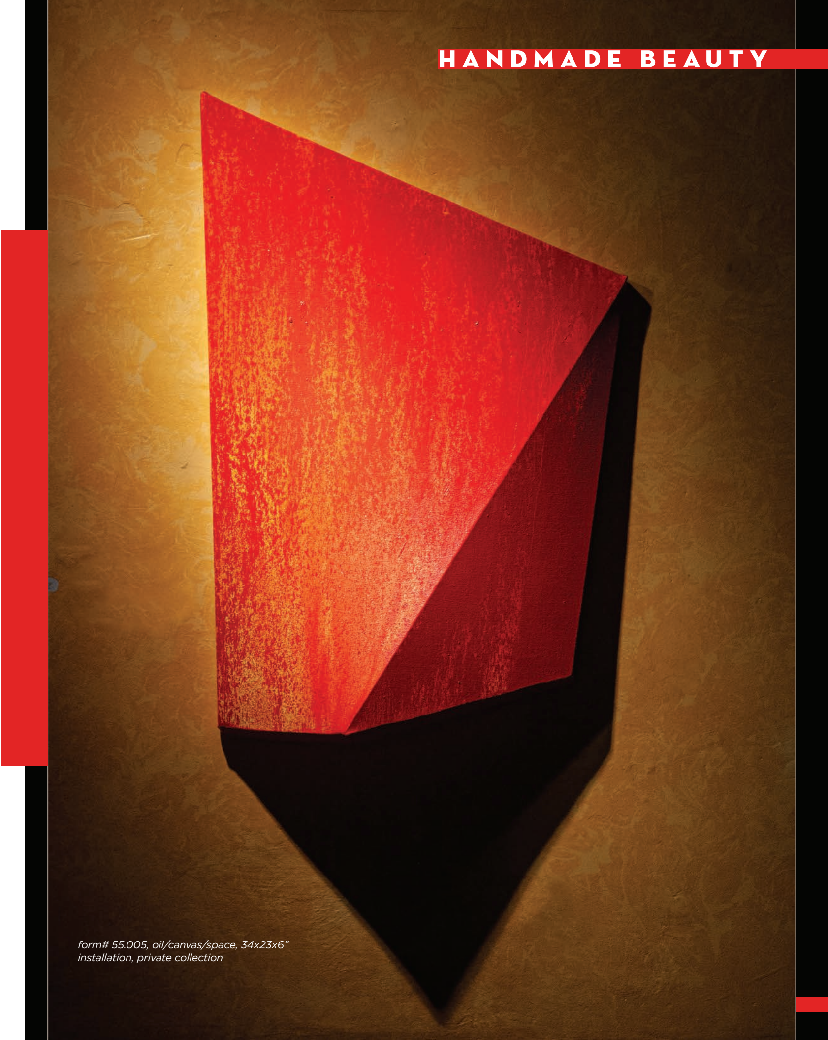
form# 55.005, oil/canvas/space, 34x23x6" installation, private collection